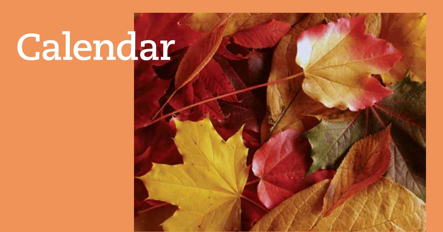
Hartford Hospital Programs & Events From September 15 through December 31, 2013