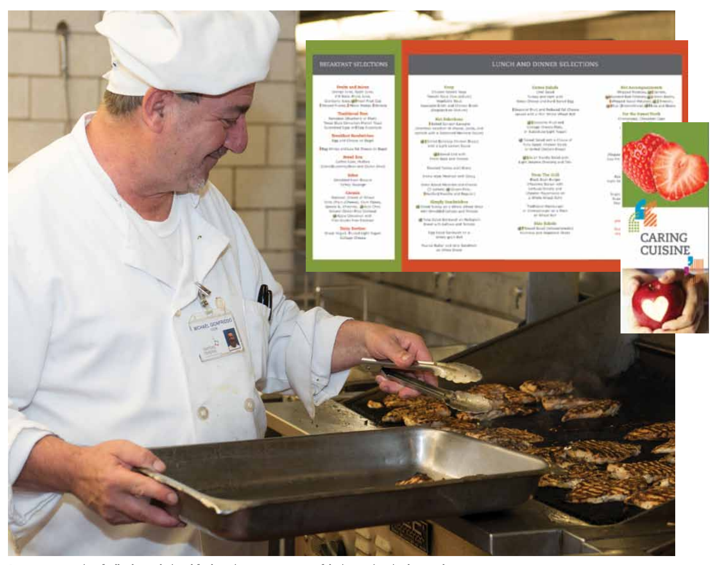
In response to patient feedback, a redesigned food service system was one of the innovations implemented.

It's probably fair to say that no one really likes going to the hospital. Unless it's to welcome a new baby, anyone who's admitted to the hospital is having health problems, and that means probably feeling anxious and stressed, as well as physically uncomfortable. Hartford Hospital recognizes this and is determined to make each patient's experience the best it can possibly be. The hospital recently ramped up its efforts by creating a new position, director of patient experience, and appointing a seasoned professional to the post.